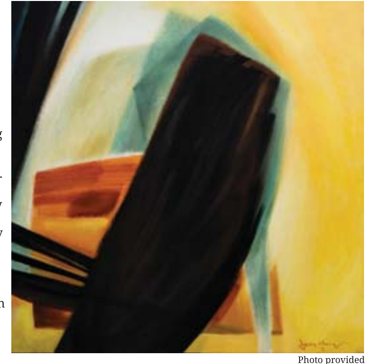
Jared Young Chong's "Hala at Sunrise," oil, 1971.

The City of Lafayette Public Art Committee is inviting artists living or working in the Bay Area to submit proposals for exhibitions in the Library Art Gallery located at the Lafayette Library and Learning Center, 3491 Mt. Diablo Blvd. in downtown Lafayette through Feb. 29. The Library Gallery at the LLLC was created to support rich and diverse artistic expression and to